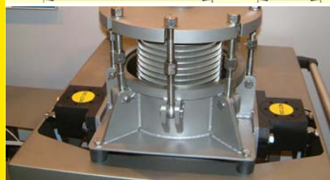
Sifting of fine grained products

* dimensions for mounting horizontal, bore ØE